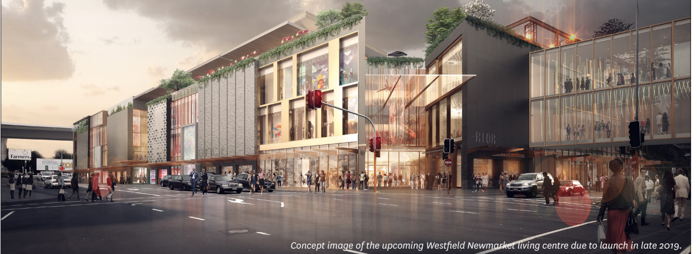
Concept image of the upcoming Westfield Newmarket living centre due to launch in late 2019.

It has become necessary to close Mortimer Pass between January and May 2019, which means there will be no road or pedestrian access during this time.